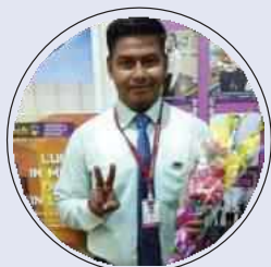
Biswajit Pal Airport Cashier Mumbai