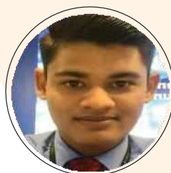
Pratham Baidh Centrum Bagdogra Airport