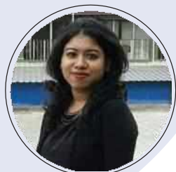
Pampa Chaudhury Airport Cashier Mumbai